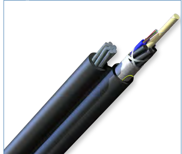
Part Number: 012KUA-T4130D20

Corning Cable Systems ALTOS® Figure-8 Gel-Free Cables are self-supporting aerial cables designed for easy and economical one-step installation. The loose tube design provides stable performance over a wide temperature range and is compatible with any telecommunications-grade optical fiber. The gel-free design is fully waterblocked using craft-friendly water-swallowable materials, making cable access simple and requiring no clean up. While the flexible, craft-friendly buffer tubes are easy to route in closures, the SZ-stranded, loose tube design isolates optical fibers from installation and environmental rigors and facilitates midspan access. The figure-8 cable design allows easy, one-step installation, using standard hardware and installation methods. These cables have a medium density polyethylene jacket that is rugged, durable and easy to strip.